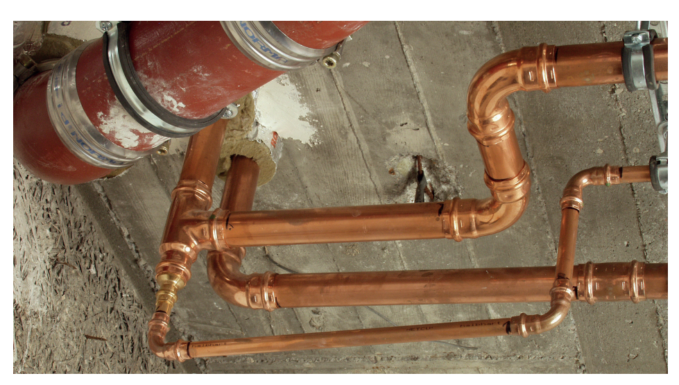
Copper was the material of choice for the heating and water pipework, selected from Viega's Profipress range.

Mechanical and electrical maintenance specialist Red100 was selected to carry out the work as the latest in a number of contracts to work on the building. The renewal of the pipework systems included the heating and chilled water systems, for both of which the supply comes off a header pipe from a plant room located in another building. The contract also included work on the greywater system.