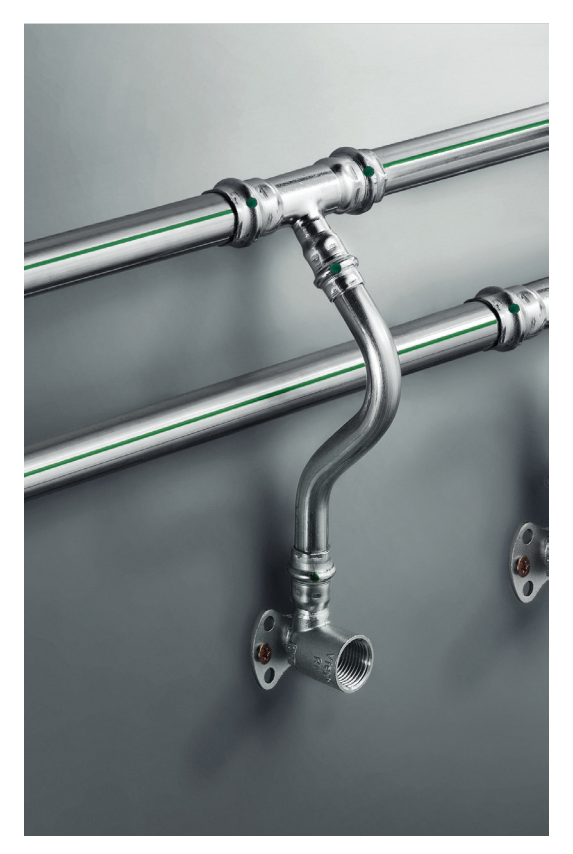
The building's greywater system utilised Viega's stainless steel Sanpress Inox system.

The scheduled ancient monument protection is granted to sites of national architectural importance and makes it a criminal offence to damage the monument in question. The importance of the building meant that during the maintenance work the materials and methods used had to be carefully considered. For example, no hot works of any kind were permitted on-site so traditional soldering or brazing of pipework was not an option.