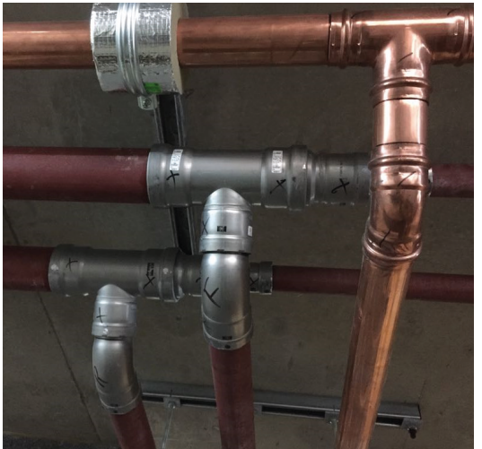
Copper was the material of choice for the hot and cold water pipework, selected from Viega's Profipress range.

The high quality German engineered press connections provided significant advantages in terms of durability and consistency of the connection as well as speed of installation. The installation took place during a major development phase at the hospital, which provided New Cross with a range of upgraded facilities.